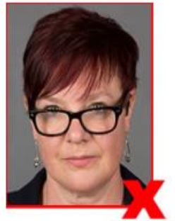
Glasses obscuring eyes