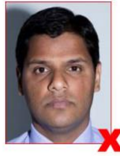
Shadow in the background