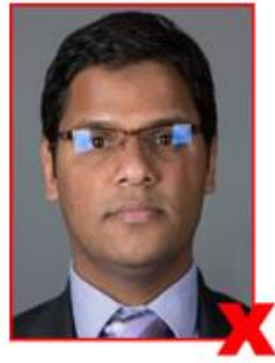
Reflection off glasses